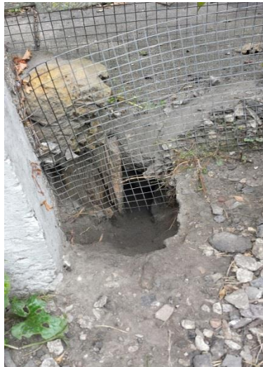
Fig. 2 Rat hole under fencing

Common methods used to control rats, such as poison, gassing and traps, are ineffective short-term solutions. Garbage and dog feces represent a continuous food supply for rats. Assuring that lids are on