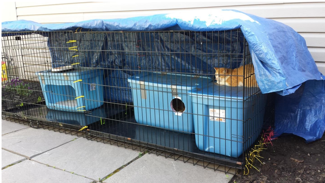
Fig. 2 Working cat in her acclimation crate with shelters and litter box

Cats at Work is the only hope for many displaced, feral community cats to be placed in safe, secure locations for the rest of their lives! First, a member of our Community Cats Team comes to your property to help you determine the best place for the cats to acclimate, as well as a good place to locate well-insulated, yet lightweight and portable winter shelters. All cats are acclimated in confinement at their location for 3 - 4 weeks. Acclimation can be in a backyard, shed, garage or basement. Many people choose to retrofit a space under their porch or deck to make a private “cats’ den.” No matter where you acclimate the cats, most of the time cats will need to start off in large dog crates in that area to ensure they do not escape. The Tree House Cats at Work Manager will help you make that determination during the site visit.