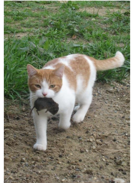
Fig. 1 Working cat with his prey

The Tree House Cats at Work Project is a “green” humane program that removes sterilized and vaccinated feral cats from life-threatening situations and relocates them to new territories where their presence will help control the rodent population. Caretakers humanely manage the cats for the entirety of their lives with ongoing support from Tree House, as mandated by Cook County’s “2007 Managed Care of Feral Cats Ordinance.” The cats’ presence alone repels rodents, causing them to leave the cats’ new territory. Cats will also hunt and catch rodents on occasion, but when they are fed regularly (as mandated by the program), they usually won’t eat them.